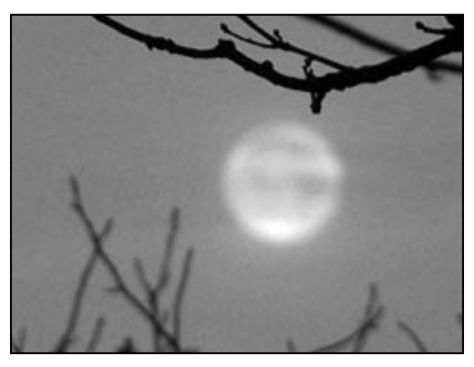
Full moon and branches, Thanksgiving 2005.

mind that come when one meets a teacher whom one trusts. I take saddhā , faith, to be faith in the Triple Gem, particularly in the Buddha as the Fully Enlightened One, the one who has fully understood the ultimate truths that bring the resolution of our existential predicament. It also means trusting confidence in the Dhamma as the teaching that discloses the truth about the existential predicament and its solution, as well as the path that leads to that resolution; in other words, the path that leads to enlightenment and liberation. And faith in the Sangha, that is trusting confidence in the community of noble ones, the confidence that those who have followed the teaching have personally gained wisdom and purified themselves of defilements.