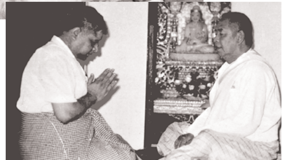
Top: S.N. Goenka offers meditation instruction during a retreat at the Burmese Monastery in Bodhi Gaya, India, 1971. Right: S. N. Goenka pays his respects to his teacher, Sayagyi U Ba Khin, at the International Meditation Centre in Yangon, Burma, circa 1968.