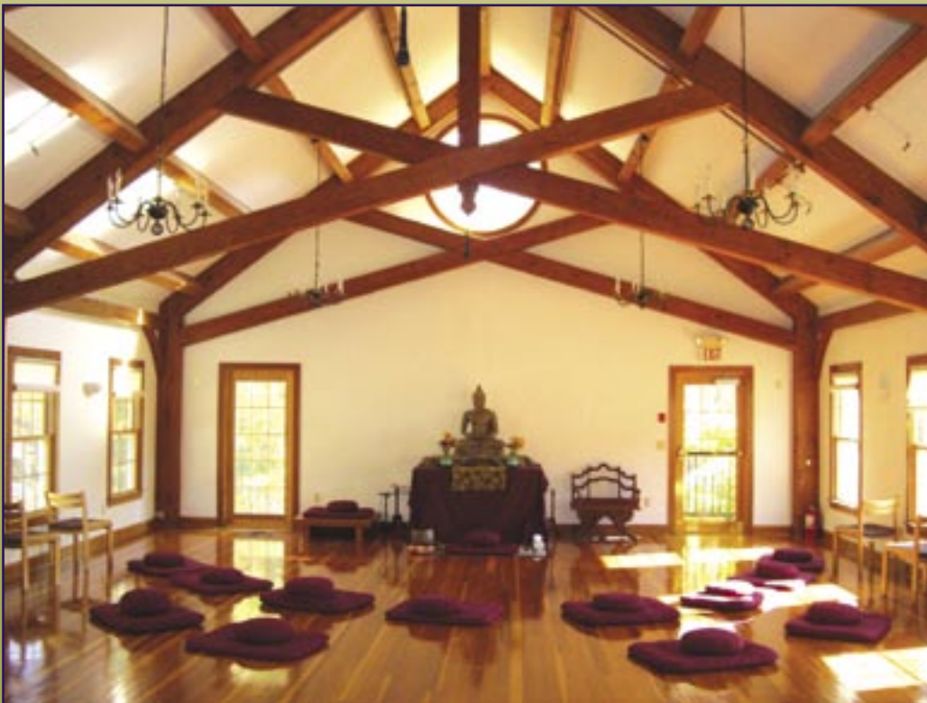
The Dharma Hall

Located on 90 acres of wooded land in rural, central Massachusetts, just a half mile from the Insight Meditation Society, BCBS provides a peaceful and contemplative setting for the study and investigation of the Buddha's teachings. A 225-year-old farmhouse holds a library, offices and a dining room that provide a comfortable setting for students, staff and teachers. A dormitory and classroom/meditation hall provide space for classes, workshops and retreats, and three cottages provide secluded space for independent study.