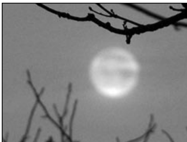
Full moon and branches, Thanksgiving 2005.

mind that come when one meets a teacher whom one trusts. I take saddhā , faith, to be faith in the Triple Gem, particularly in the Buddha as the Fully Enlightened One, the one who has fully understood the ultimate truths that bring the resolution of our existential predicament. It also means trusting confidence in the Dhamma as the teaching that discloses the truth about the existential predicament and its solution, as well as the path that leads to that resolution; in other words, the path that leads to enlightenment and liberation. And faith in the Sangha, that is trusting confidence in the community of noble ones, the confidence that those who have followed the teaching have personally gained wisdom and purified themselves of defilements.